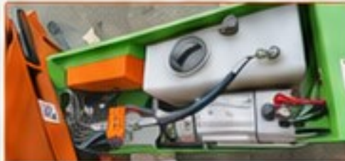
Hydraulic system unit