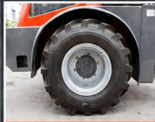
High shear forces from planetary axle