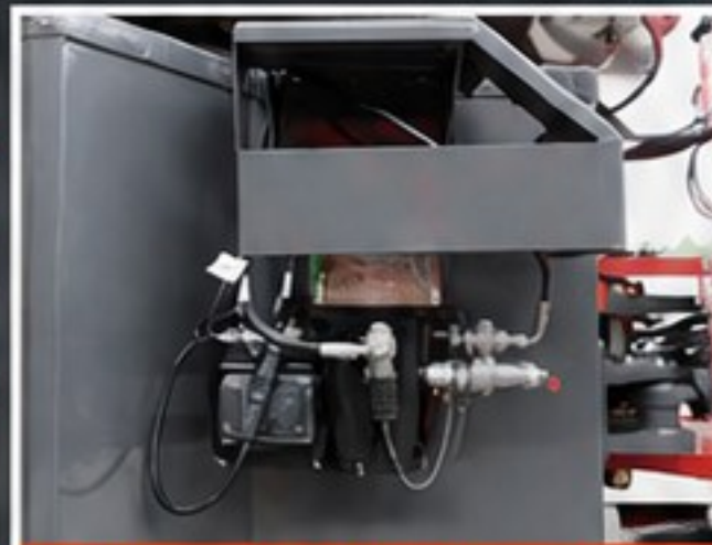
Easily accessible lubrication points