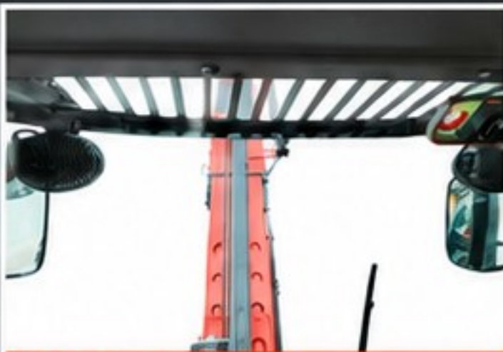
Good view of the freight

Overall Dimensions 5030 × 2580 × 1570 mm