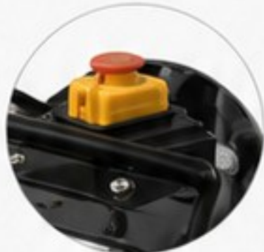
Emergency stop switch

The Austter EC50 Electric Wood Chipper is designed for gardens, estates, and landscaping work. Featuring a traditional drum cutting system, it delivers efficient wood shredding performance with a 50mm chipping capacity and a durable 65L collection bag.