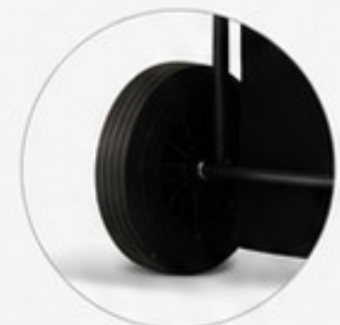
10" solid rubber