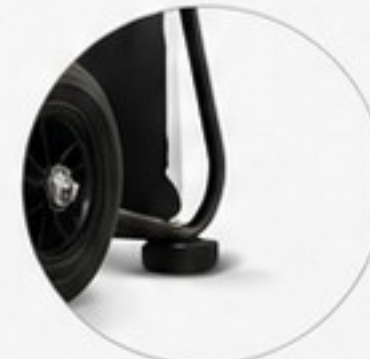
Support the machine to work stably