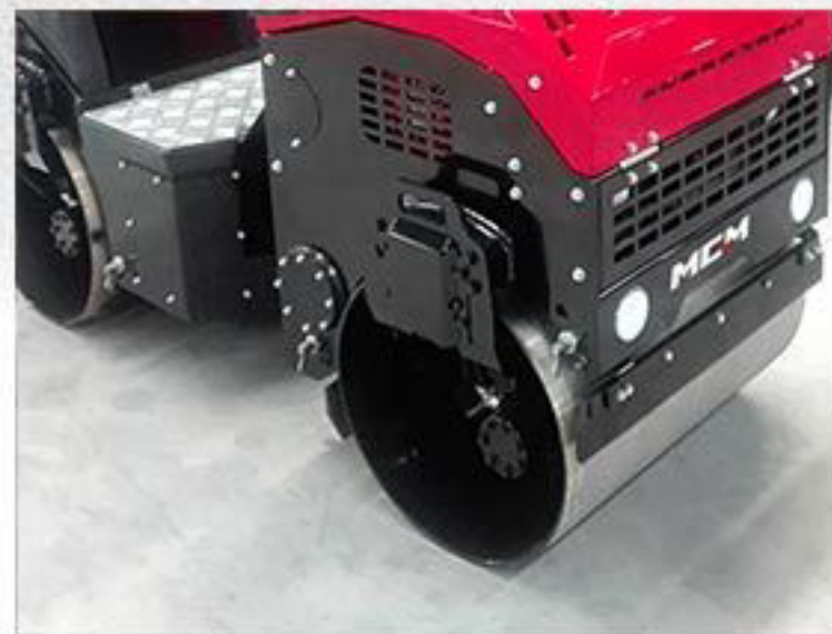
Double Drum Steering