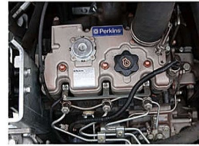
Perkins water cooled diesel engine.