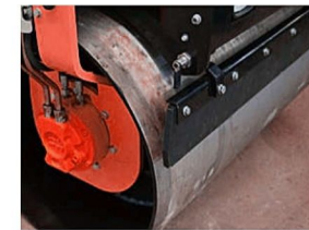
Wear-resistant scraper that can be fully adjusted.