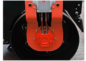
Imported Danfoss travel motors from USA. Double drum driving.