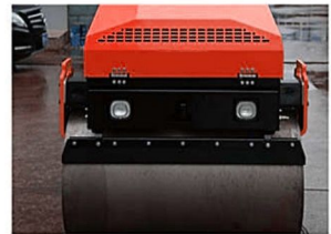
Working lamps in the front and rear.