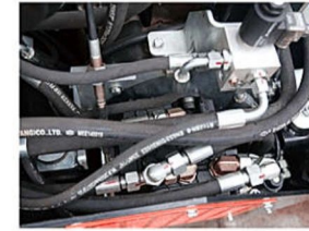
Imported hydraulic variable plunger pump.