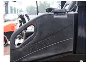
Extra-large plastic water tank, free from corrosion & easy to spray.