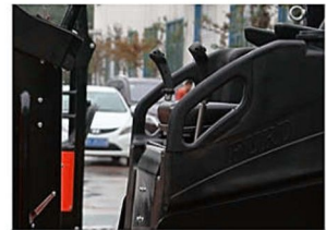
Double control handles with vibration button.