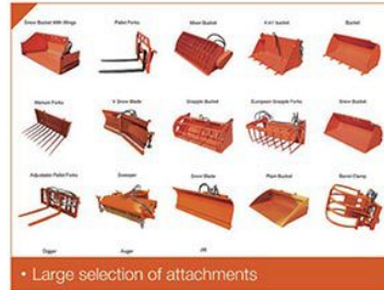
• Large selection of attachments