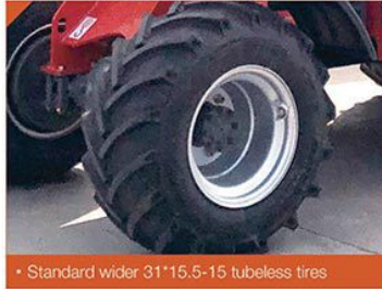
• Standard wider 31*15.5-15 tubeless tires