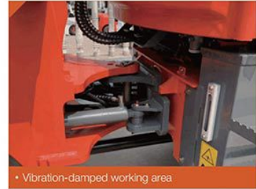
• Vibration-damped working area