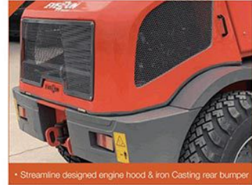
• Streamline designed engine hood & iron Casting rear bumper