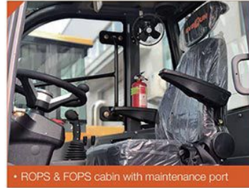
• ROPS & FOPS cabin with maintenance port