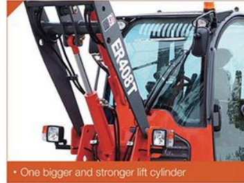
• One bigger and stronger lift cylinder