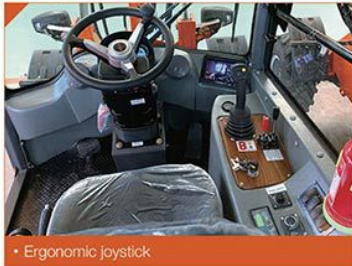
• Ergonomic joystick