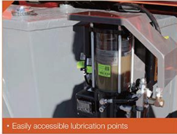
• Easily accessible lubrication points