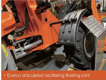
• Everun articulated oscillating floating joint