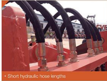
• Short hydraulic hose lengths