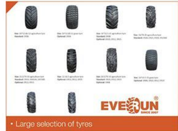
• Large selection of tyres