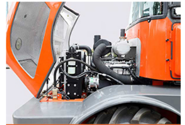
Easy-to-open engine hood