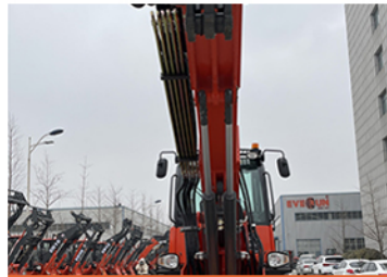
Two stronger lift cylinder