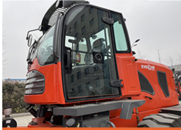
Comfortable cabin and good visibility