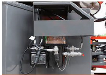
Easily accessible lubrication points