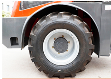
High shear forces from planetary axle