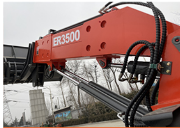
Sturdy telescopic arm