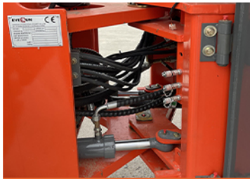
Everun articulated oscillating floating joint