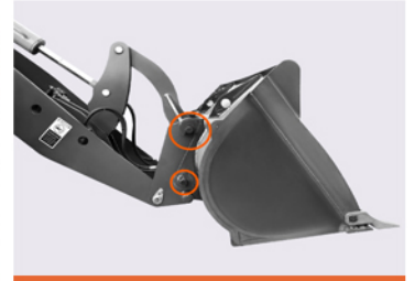
Quick and easy tool change