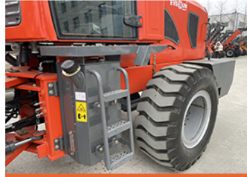
High quality build